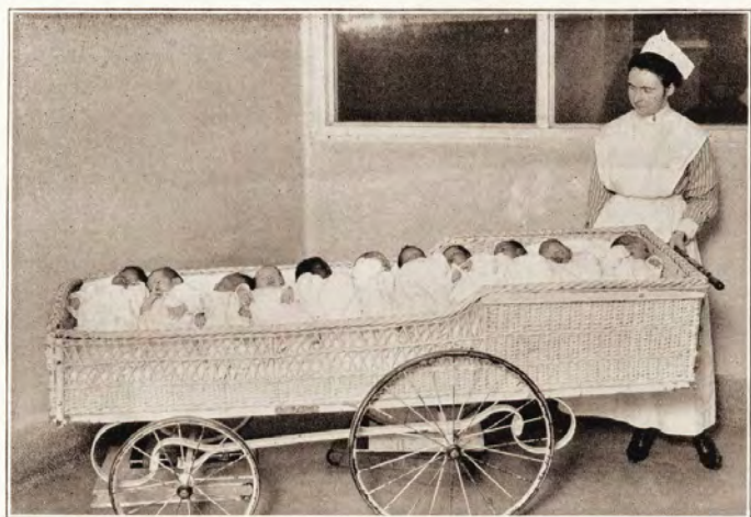
"ON THE WAY TO MOTHER" OBSTETRICAL DEPARTMENT, COOK COUNTY HOSPITAL

This grant is designed to encourage and support graduate training and historical research at the Masters and Doctoral levels.