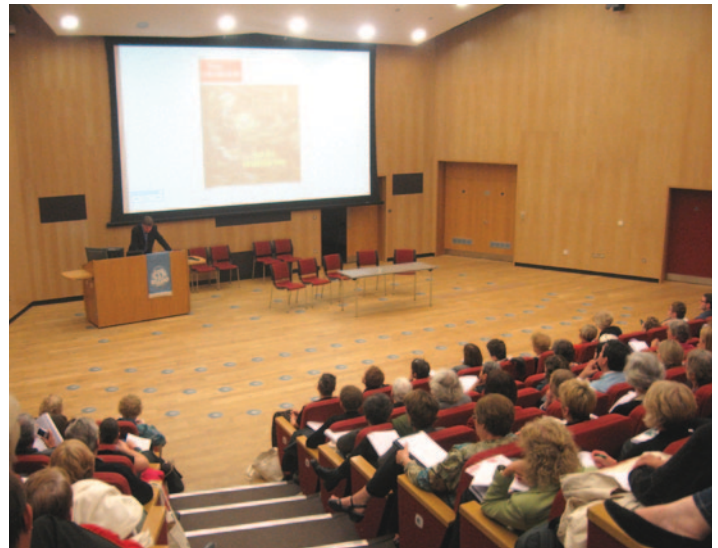
Bostridge Plenary Session