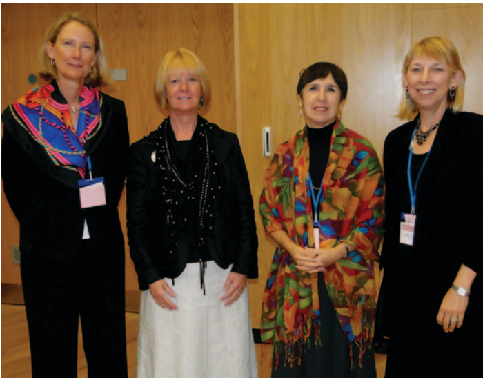
Public Health Panel