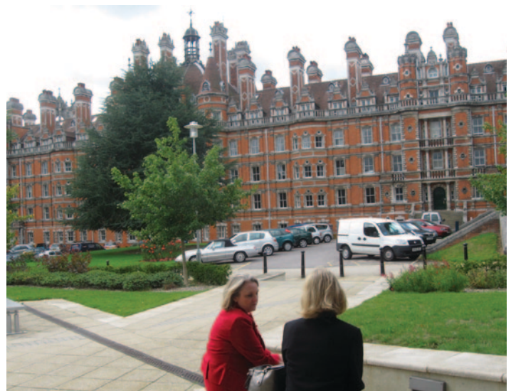
Delegates at Windsor Conference Center